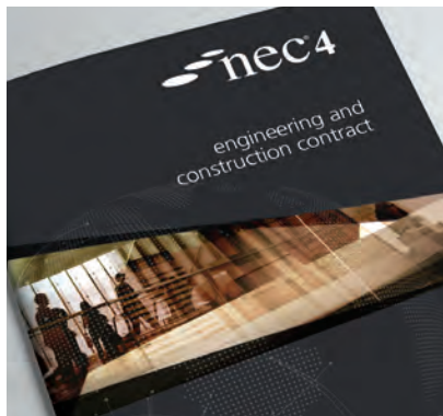
NEC4 Engineering and Construction Contract (ECC)

There is now only one Schedule of Cost Components (SCC) in NEC4 contracts main options C, D and E. The Short Schedule of Cost Components (SSCC) has been removed from these contracts to make things simpler.