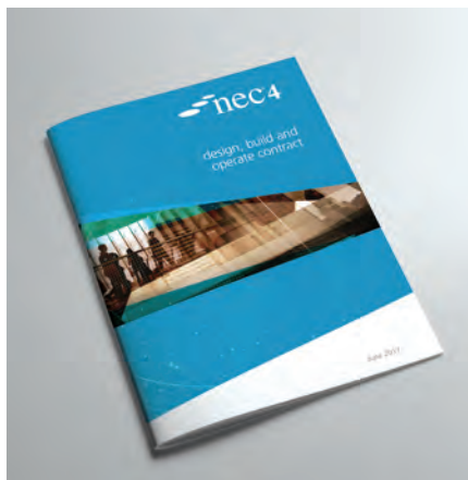
NEC4 Design Build Operate Contract (DBO)

The DBO contract can include a range of different services to be provided before, during and after engineering and construction works are completed. These could include operation of the asset to achieve required performance levels, more straightforward facilities management (FM) type services, or a combination of both.