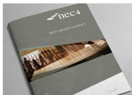
NEC4 Term Service Contract (TSC)

The Professional Services (PSC), Term Service (TSC) and Supply Contracts (SC) now use Defined Cost in the same way as Engineering and Construction Contract (ECC). These refer to the method of assessing costs in the Schedule of Cost Components.